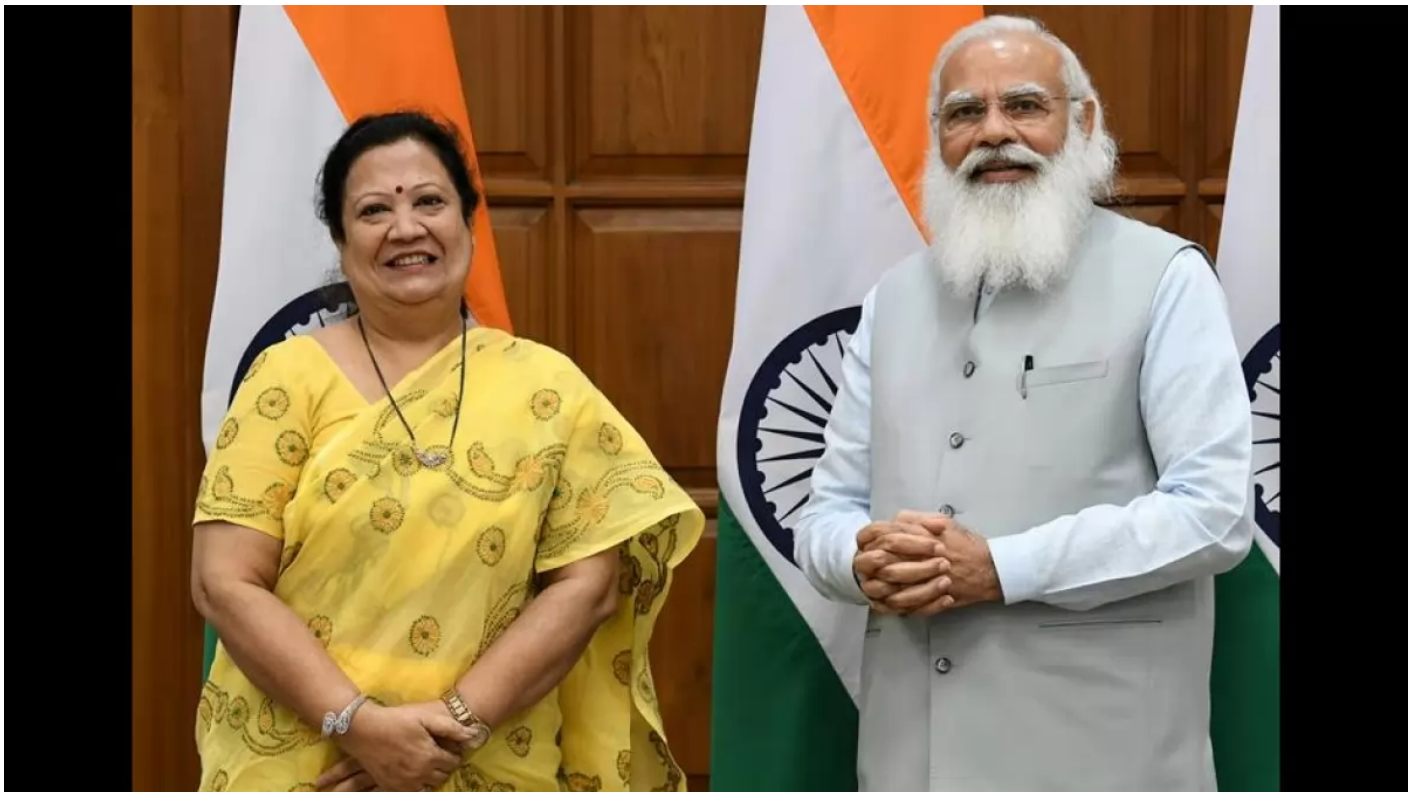
Darshana Vikram Jardosh